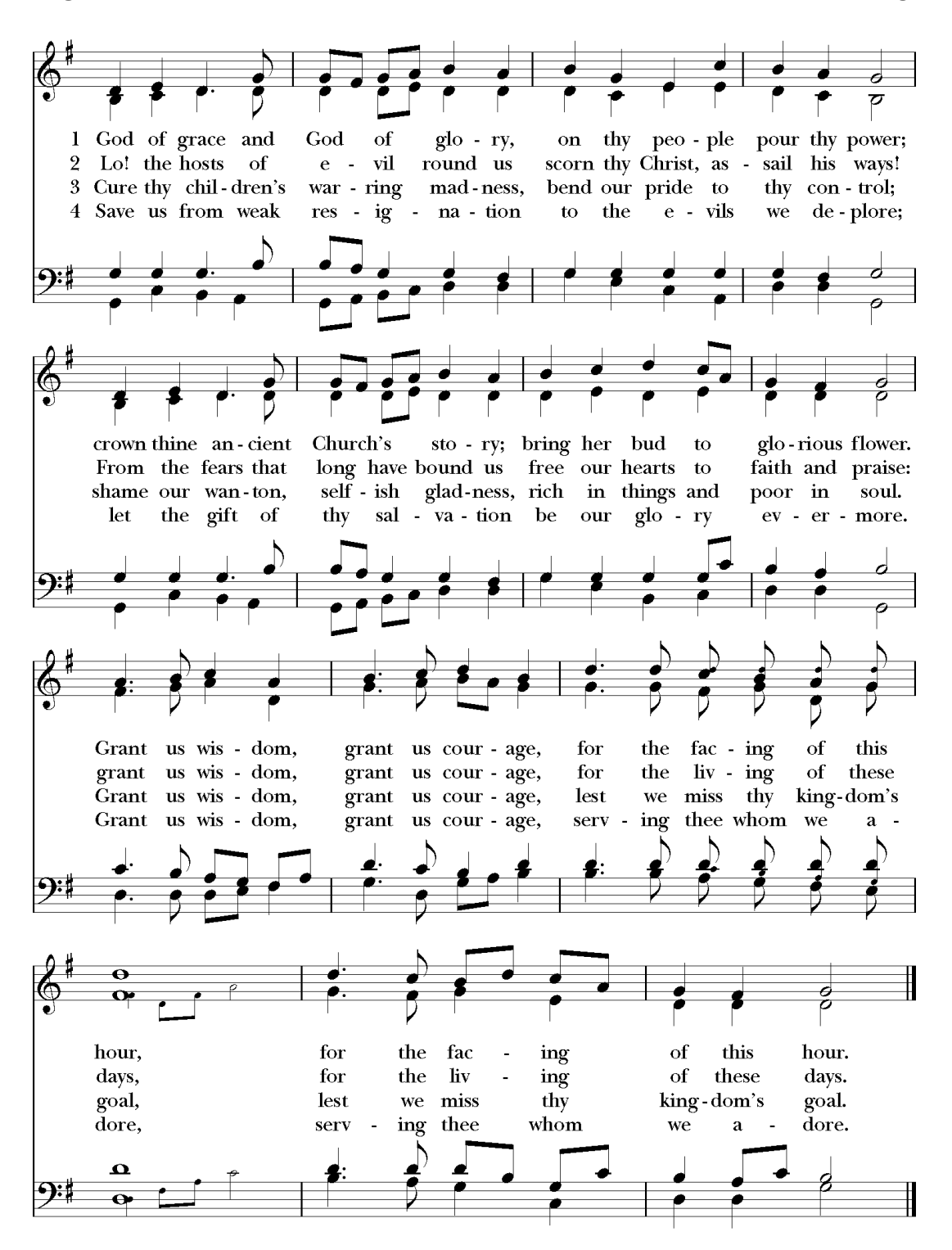
Blessing & Dismissal